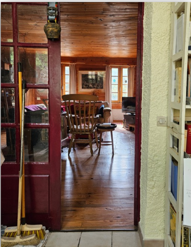
View into living room