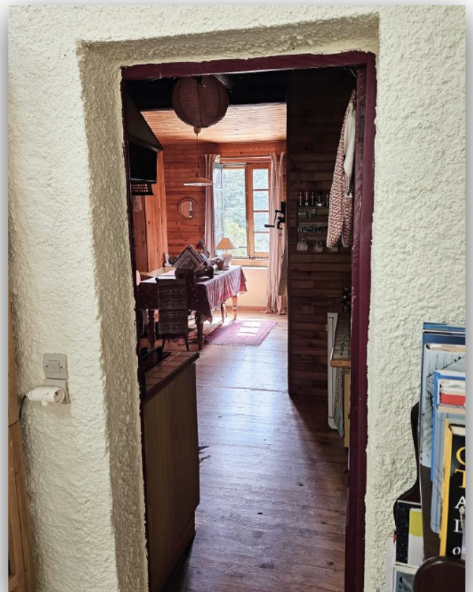
View into kitchen