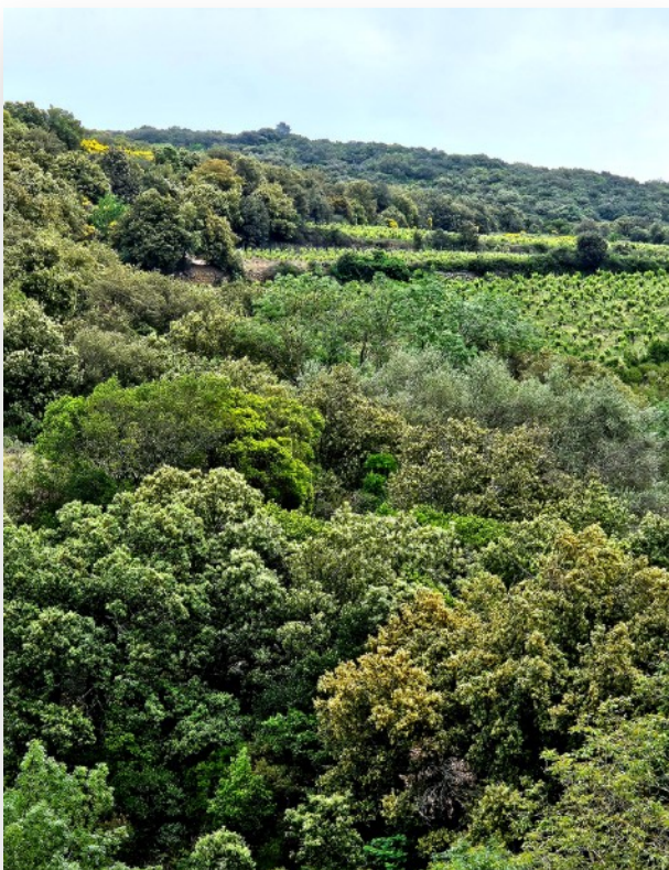
View from living room