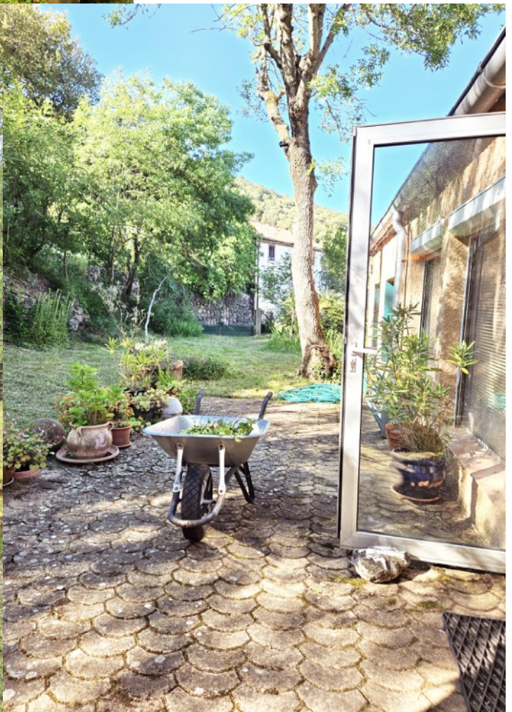
Terrace and main entrance